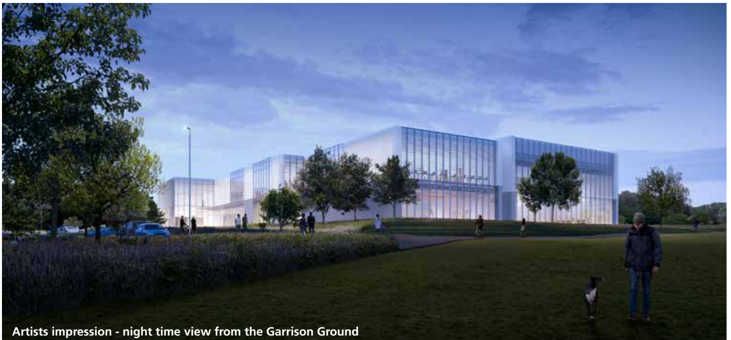
Artists impression - night time view from the Garrison Ground